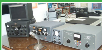
CE Collins Dream Station 400

In the exhibit arena, owners and operators of radios dating from the late '40s to the early '60s, both commercial and home brew, will be on hand to demonstrate the most rare and unique examples of technology from those times. Most of the exhibits will be examples of early SSB operation but some other interesting pieces such as vintage WWII stations are also invited. Space permitting, operators in the exhibit arena are welcome to offer some vintage equipment for buy/sell/trade. For all those not invited to display equipment in the exhibit arena, entry fee will be $10.